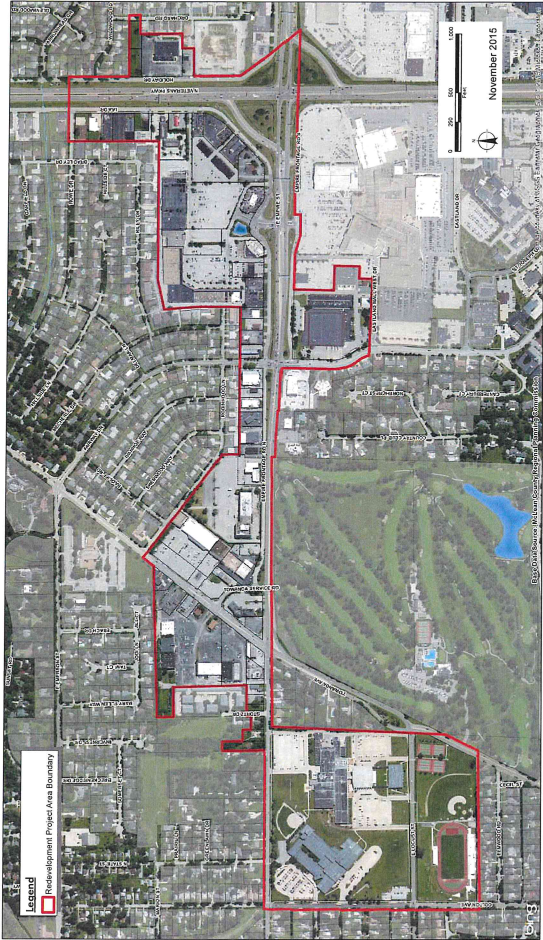
Exhibit A - Redevelopment Project Area Boundary

Empire Street Redevelopment Project Area